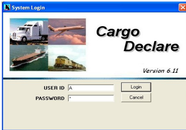
( figure 1.0 )